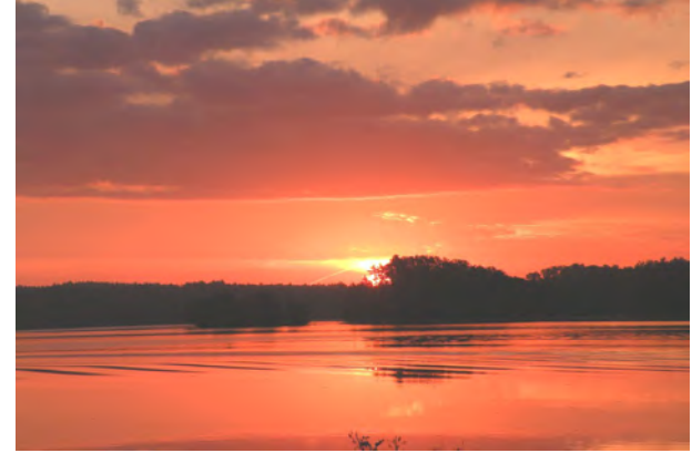
Croton Pond at Sun Rise

On the shores of the Muskegon River at Croton Pond