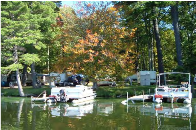
Docks for rent