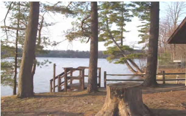
Steps to one of the boat docks