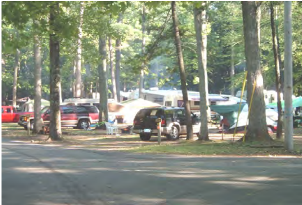
View from the Croton Township Campground